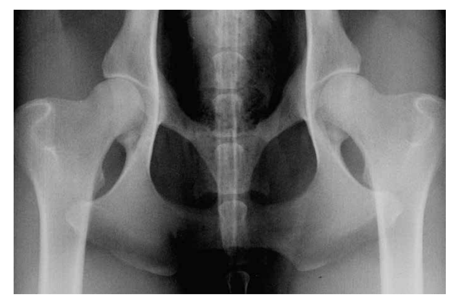
Radiograph of normal hips in a greyhound. The hip is a 'ball-and-socket' joint, the ball being the head of the thigh bone or femur, and the socket being part of the pelvis called the acetabulum. In good hips the femoral head is smoothly rounded and fits tightly and deeply into the acetabulum. The outlines of the bone are clear since there is no secondary osteoarthrosis. Compare this image with those of dysplastic joints below and on page 3.

ip dysplasia (HD) is a common inherited orthopaedic problem of dogs and a wide number of other mammals. Abnormal development of the structures that make up the hip joint leads to subsequent joint deformity. 'Dysplasia' means abnormal growth. The developmental changes appear first and because they are related to growth, they are termed primary changes. Subsequently these changes may lead to excessive wear and tear. The secondary changes may be referred to as (osteo)arthritis (OA), (osteo)arthrosis or degenerative joint disease (DJD).